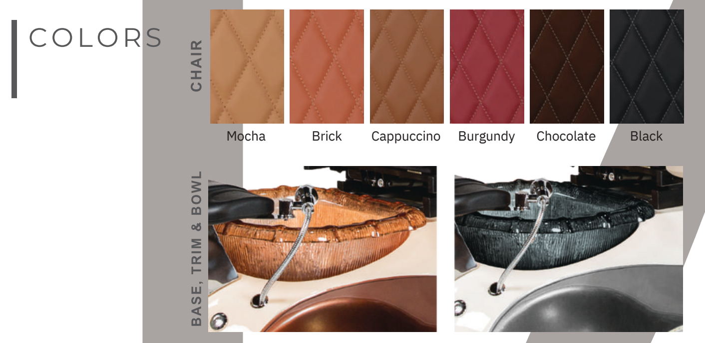
Bone Base with Brown Trim Gold Resin Bowl