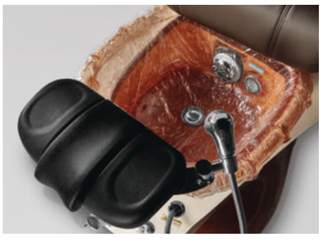
DURABLE RESIN BOWL The easy to clean resin bowl provides for Comfort and relaxation are offered by a delightful spa treatment, especially with the height adjustable footrest liners