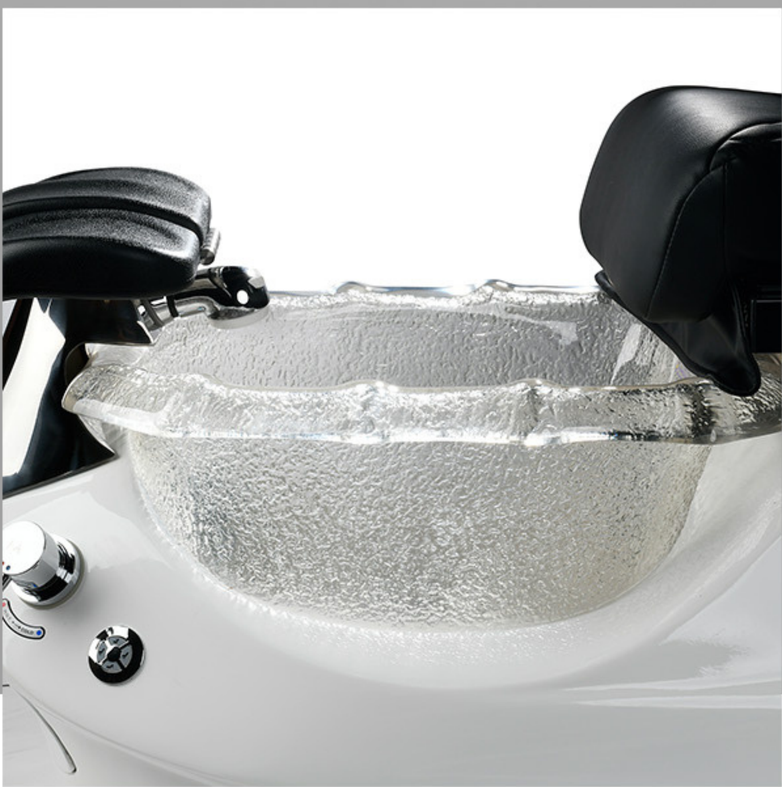
White Base/Crystal Bowl