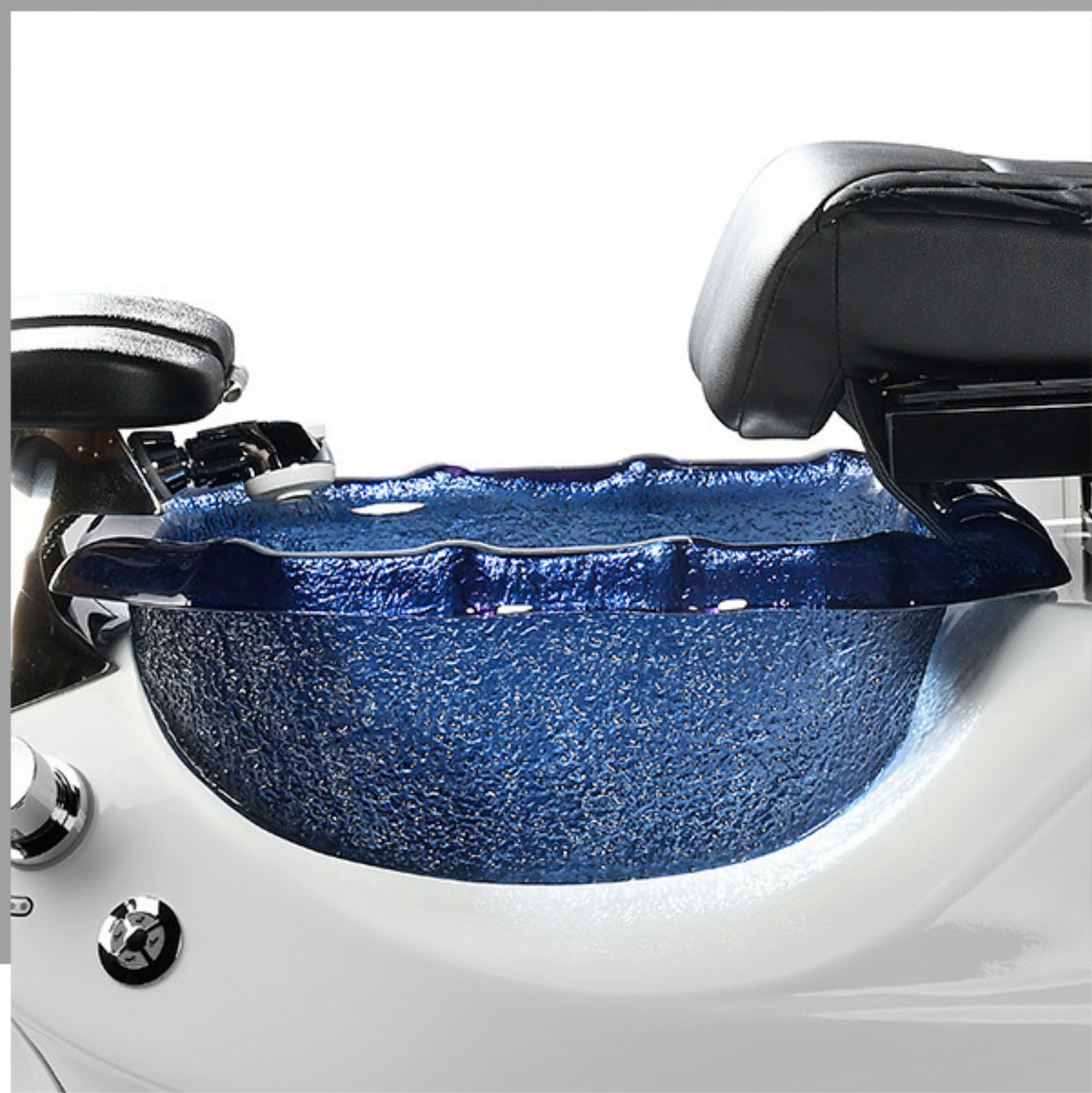
White Base/Dark Blue Bowl

*Due to differences in monitor or print settings, there may be a slight difference in color between what is shown on the site/catalogue and the final product. If you would like to see the product in person, please contact us so we can direct you to the nearest distributor showroom to see a sample.