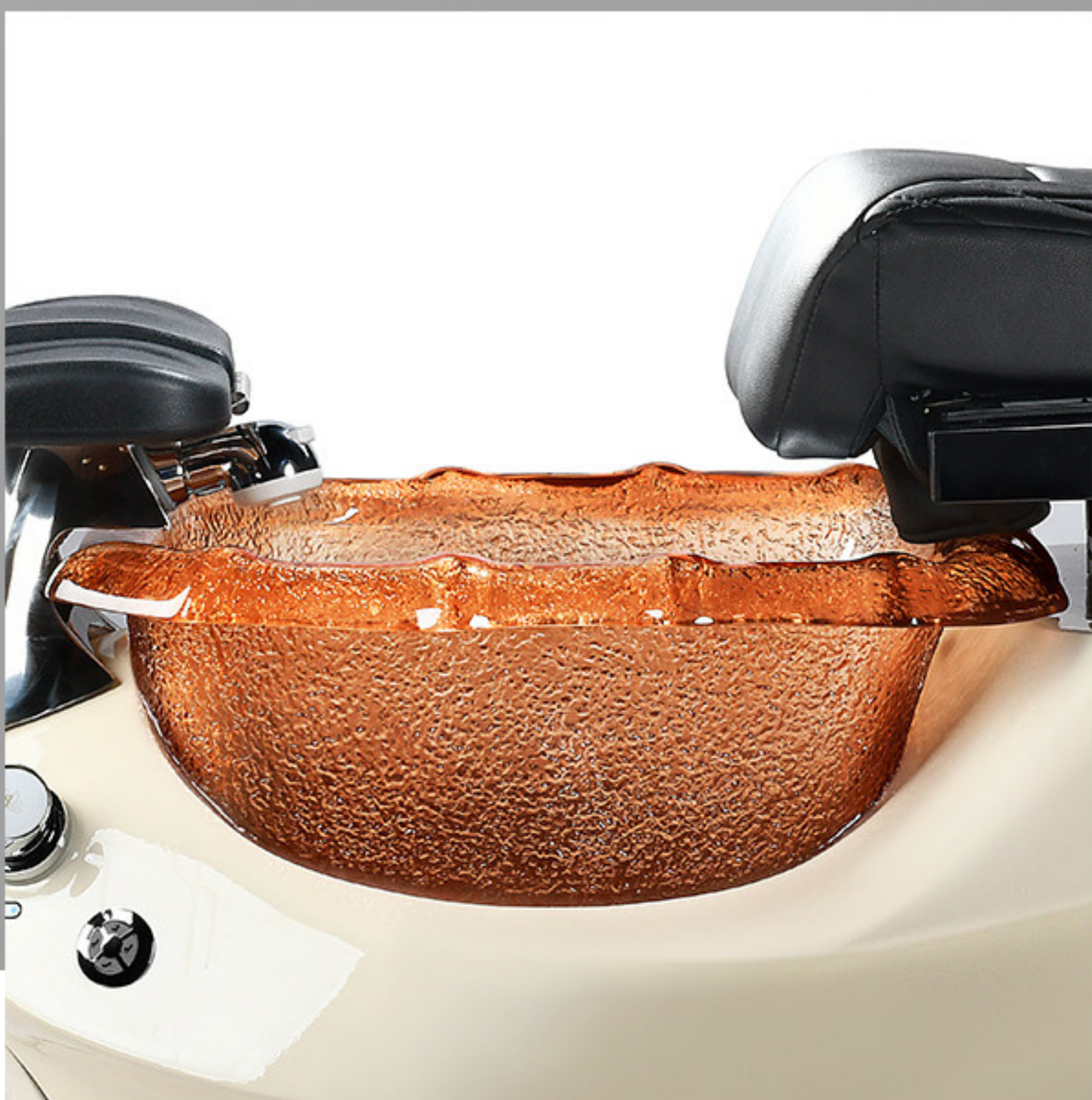
Bone Base/Gold Bowl