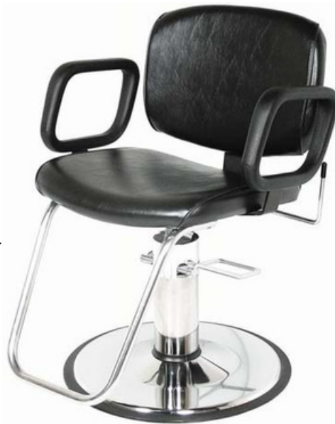
1810 All Purpose Chair w/ Standard Base