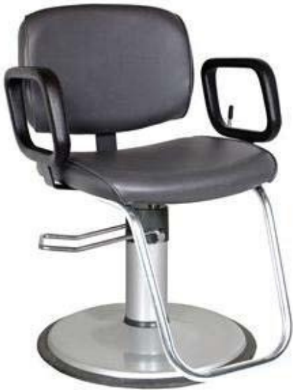
1810V All Purpose Chair w/ Enviro Base

Foot-operated hydraulic base - 7.5 years, Reclining mechanism - 5 years, Molded urethane arms - 3 years