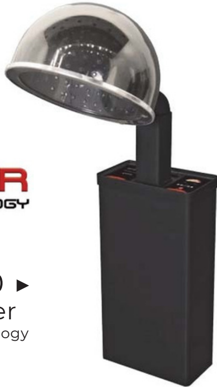
2200 ▶ SolAir Dryer w/ IONIC Technology