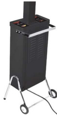
WA-300 Wheel Kit